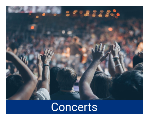
Benefits concerts are great for music-loving fundraisers who want to be creative and fun with how they raise money for Polaris.

Organizing a fundraising event or benefit is a great way to raise money for Polaris! You can decide what kind of event you want to host and how big you want it to be. Here are some go-to ideas for an event or benefit that are sure to be fun and successful.