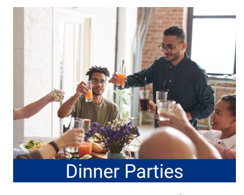
Get together with your family and friends to have fun, eat great food, and do some good! You can suggest guests make a small $10 donation in support of Polaris.